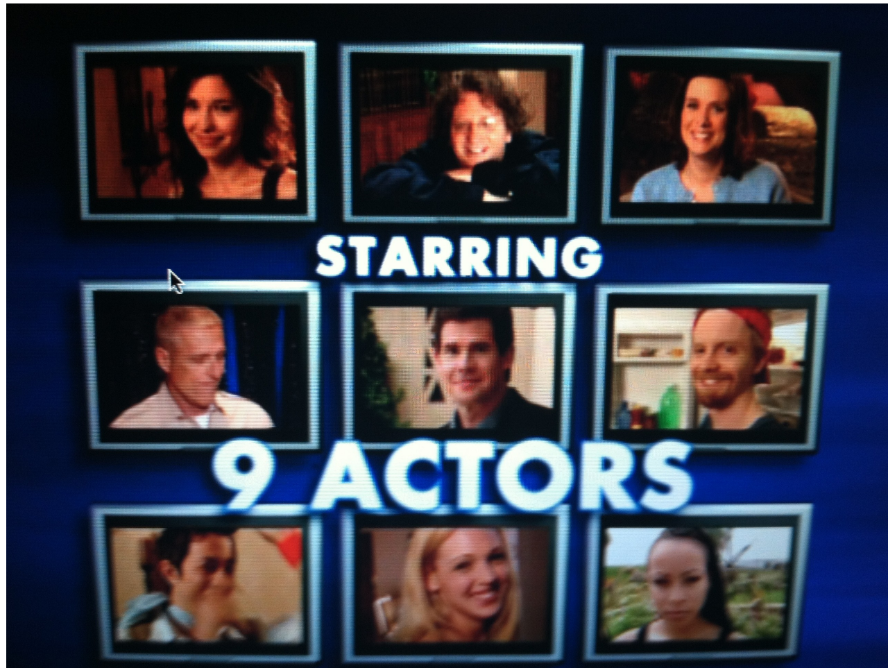
The Joe Schmo Show